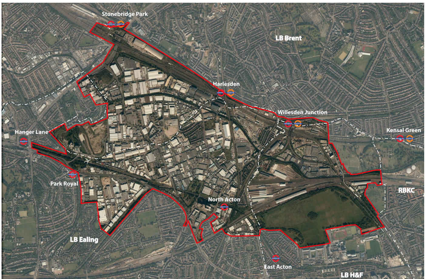
A map of the local area

It has been home to both the design and manufacturing of many iconic UK products and businesses: the Routemaster Bus, Brompton Bikes, Jaffa Cakes, Heinz Soup and Rolls Royce to name a few.