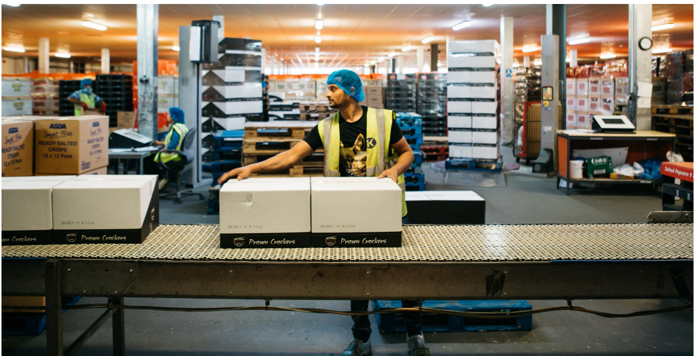
The Kolak Snack Food Ltd. factory in Park Royal.

Proposals should clearly demonstrate how they will embed and engage local communities, artists, workers, businesses and/or schools throughout the process. Proposals should also describe how the work will be presented in a way which is fully accessible to a wide and diverse audience, both locally and from across London.