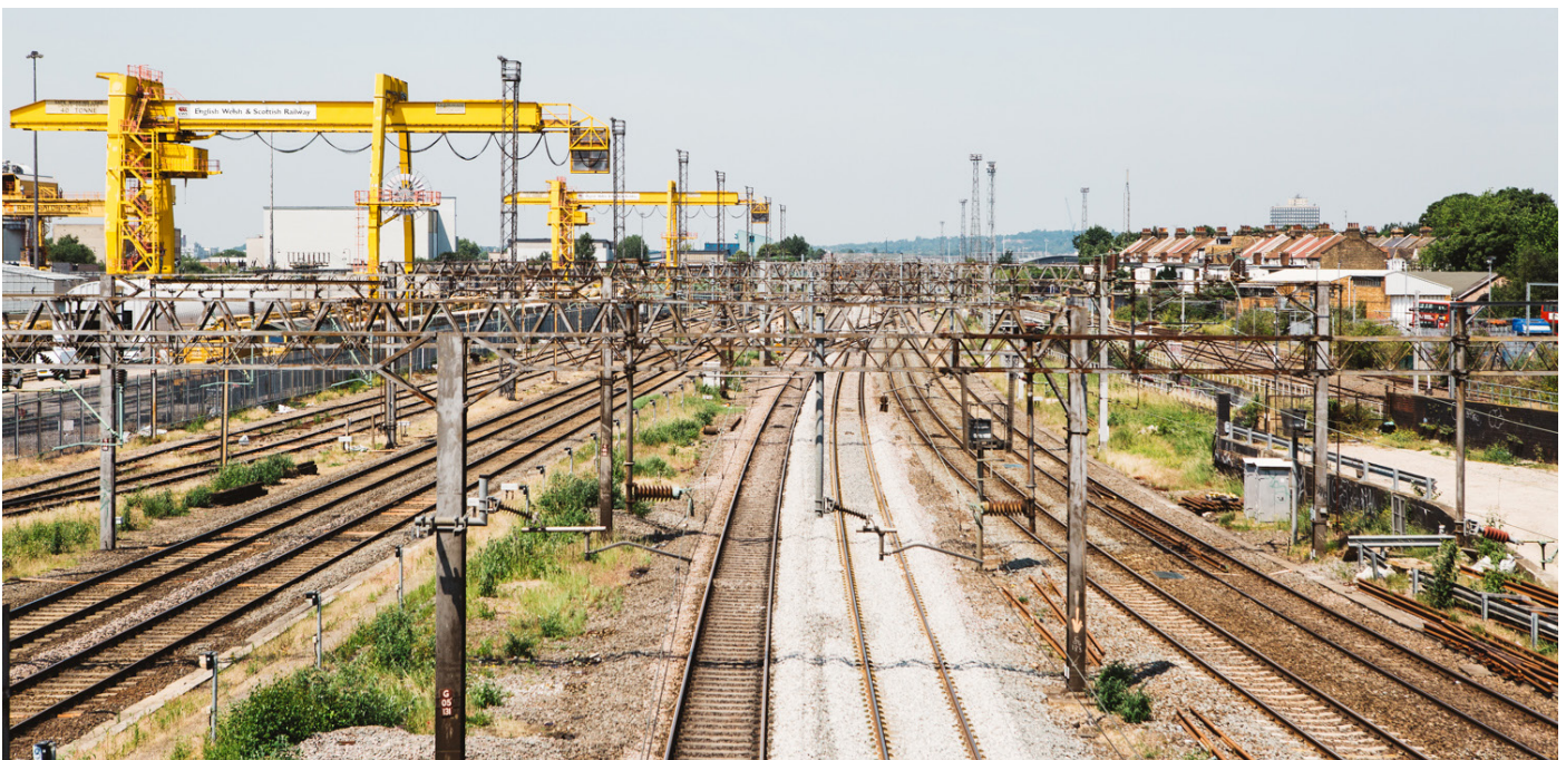
View of existing industrial and rail infrastructure at Old Oak.

Artists are able to raise additional funding towards the project from other sources, such as sponsorship or grants, although these would need to be agreed with OPDC in advance. You would still be required to present a proposal for a project that can be delivered within the £50,000 budget, in the event that you are not successful in securing additional funding to enhance your proposed idea.